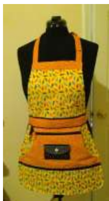
June Scott created an entire matching ensemble; face mask, hand sanitizer holder and apron!